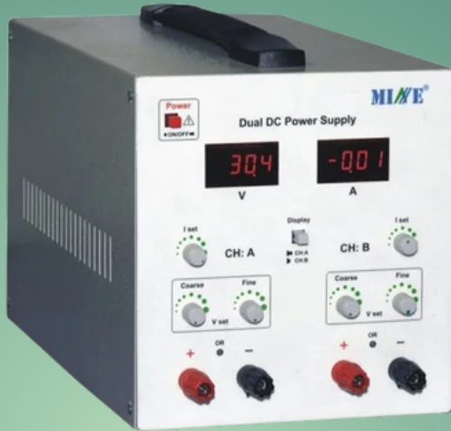
Variable Power Supply model: TKB-VPS-101

This is regulated variable power supply which can vary voltages between 0 to 30 Volt and Current can vary from 0 to 5A. Short circuit/Over load/ Over voltage/ Over temp protection.