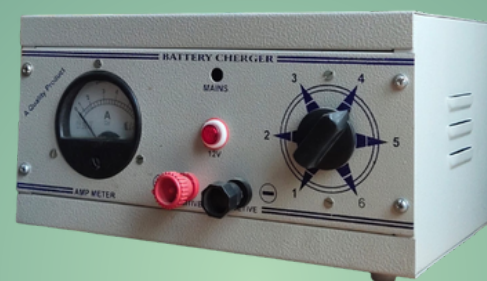
Battery Charger Model:TKB-BC -101

This is (12V 10A/ 12V 6A) universal Battery Charger which can charge UPS, Inverter, Motorcycle, Car, Bus and Truck , emergency light etc.