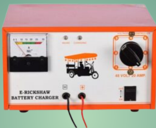
Universal/E-Rickshaw Battery Charger Model: TKB-UBS-101

This is 48V 15A/60V 20A automatic Universal Battery Charger (All in One) which can be used for E-Rickshaw.