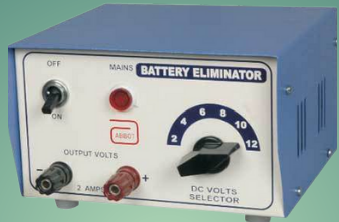
Battery Eliminator Model:TKB-BE-101

This is regulated power supply which eliminates between 02 To 12V.